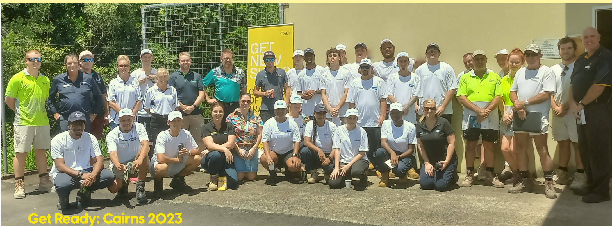
Get Ready: Cairns 2023